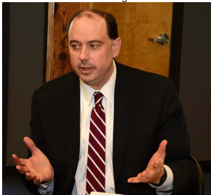
Senator Jamie Eldridge