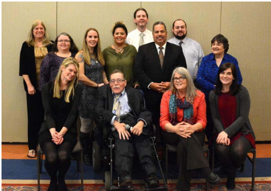
MetroWest Center for Independent Living