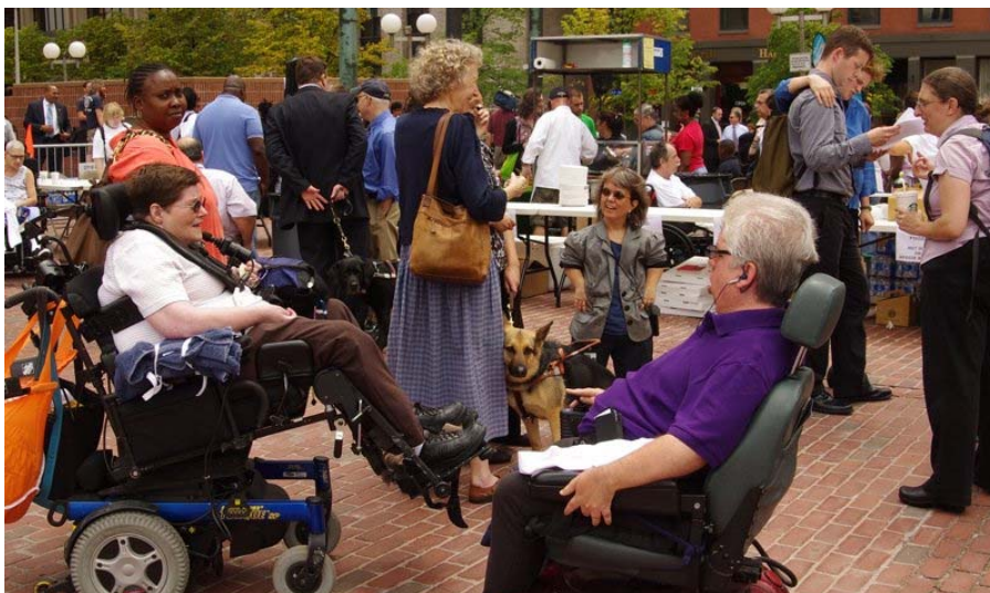
2011 Celebration at City Hall Plaza

Celebrate the 28th anniversary of the ADA!