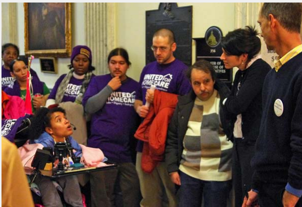
PCA Advocacy in 2011