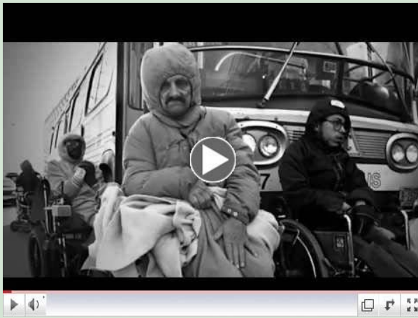
Trailer to the movie: "Lives Worth Living"

For more information about the film, visit the Independent Television Service website .