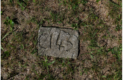
SD 2424 and HD3868 will take the first steps toward acknowledging the legacy of institutions in Massachusetts.

The devastation of the Covid-19 pandemic has shown us how institutions impact the lives of people with disabilities. The same is true of the former state institutions.