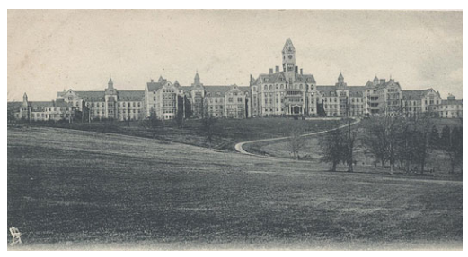
Pictured: Worcester State Hospital